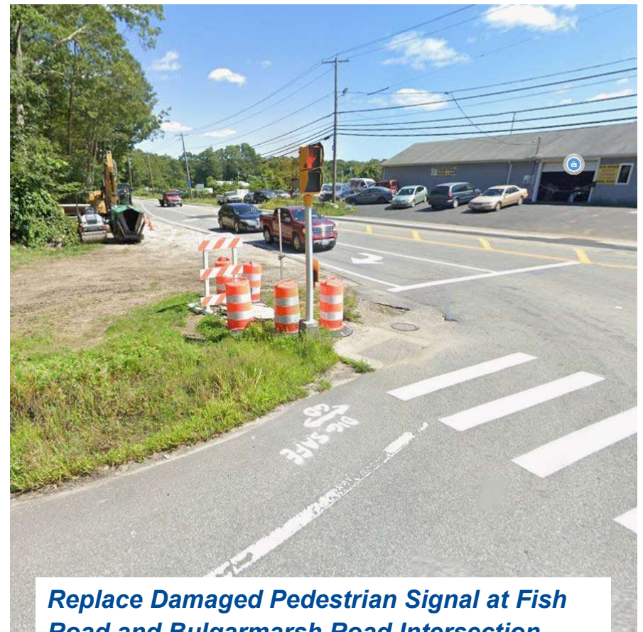
Replace Damaged Pedestrian Signal at Fish Road and Bulgarmarsh Road Intersection