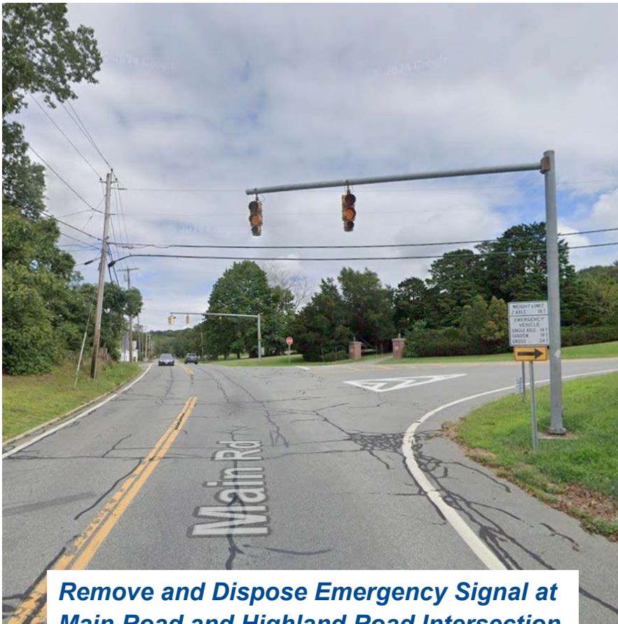
Remove and Dispose Emergency Signal at Main Road and Highland Road Intersection